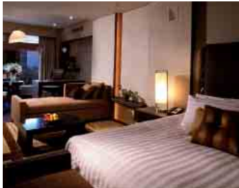
Hilton Beijing Wangfujing

Stay at any of the Hilton Family hotels in China, including its first ever Doubletree® by Hilton or the new Hilton Beijing Wangfujing, and you'll receive our customary first-class service and Triple Miles.