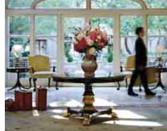
The Langham, Huntington Hotel & Spa, Pasadena

Each qualifying stay at participating hotels earns DOUBLE MILES from November 1, 2008 to January 31, 2009.