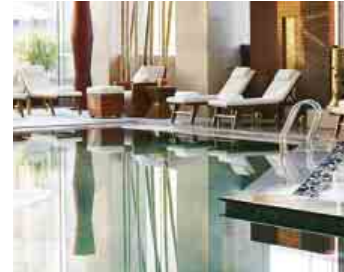
Grand Mercure Renmin Square

Stay at participating Grand Mercure or Mercure hotels from December 1, 2008 to February 28, 2009 and earn DOUBLE MILES per stay.