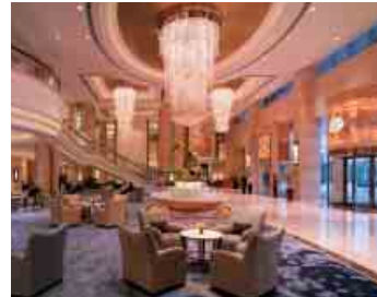
Shangri-La Hotel, Guangzhou

Between December 1, 2008 and February 28, 2009 earn DOUBLE MILES when staying at a Shangri-La hotel, resort or Traders hotel. To take advantage of this offer, simply book on-line at www.shangri-la.com on a qualifying rate and stay for a minimum of two consecutive nights.