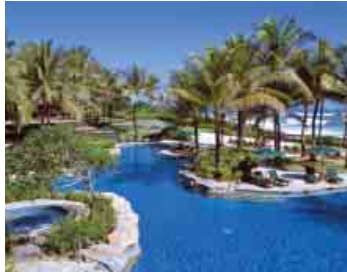
Le Méridien Nirwana Golf & Spa Resort, Bali

Earn double miles when you book and stay at least 2 nights on best available rates between December 1, 2008 and February 28, 2009. Participating Starwood hotels include most sought after brands such as Four Points by Sheraton, aloft, Le Méridien, Sheraton, Westin, Luxury Collection, W Hotels and St Regis.