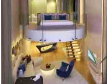
dusitD2 baraquda, Pattaya