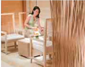
Spa cafe The Landmark Mandarin Oriental, Hong Kong

Stays at these exceptional Mandarin Oriental properties and earn DOUBLE MILES with unique Mandarin Oriental touches from December 1, 2008 to February 28, 2009.