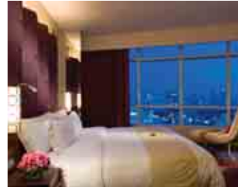
Centara Grand CentralWorld, Bangkok

Choose from three Centara hotels and resorts in Thailand and enjoy room rate discounts, additional benefits and DOUBLE MILES with stays of 2 consecutive nights or more.