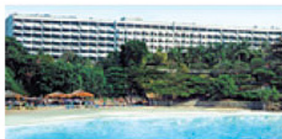
ASIA PATTAYA BEACH (T)

312 rooms. A comfortable hotel just 2 kms from central Pattaya, the hotel is located right by the beach and features a variety of facilities for tennis, golf and all kinds of water sports.