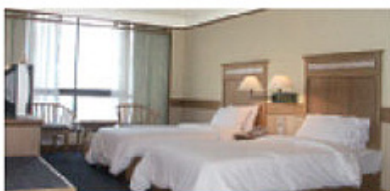
CHOLCHAN PATTAYA RESORT (F)

573 rooms. Located just 5 kms from the centre of town, this comfortable high-rise hotel with a private beach is in north Pattaya. All rooms have recently been upgraded.