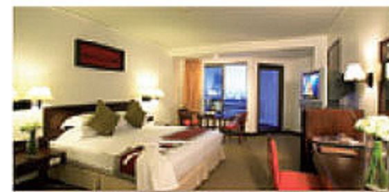
AISAWAN RESORT & SPA (S)

270 rooms. Located at the end of Pattaya Bay, with easy access to places of interest, the resort is ideal for a beach holiday or stopover break. Low-rise buildings set in tropical gardens with a freeform pool offer an oasis of tranquility.