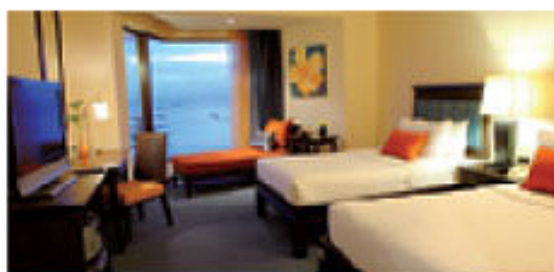
SIAM BAYVIEW HOTEL (S)

374 rooms. Newly renovated and upgraded the resort is just a five-minute drive from central Pattaya, and features comfortable accommodation with lush gardens, good facilities including a spa and a private beach.